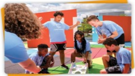
Fifth graders build collaboration skills as they create their own sports ball, game board and brand.