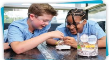
Fourth graders gain confidence while reverse engineering their robotic lab-on-wheels.