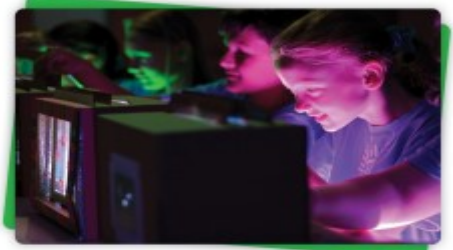
Second graders explore STEM concepts through glowing circuitry and hands-on projects.