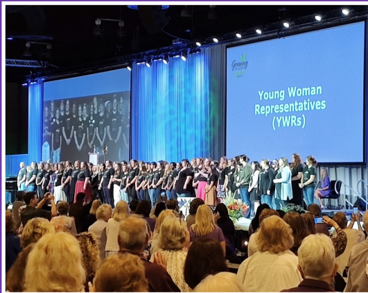
79 YWR'S from 40 districts